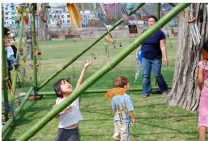
Chimes in the House to Touch the Wind