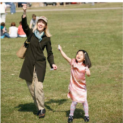
Flying kites on the Great Lawn