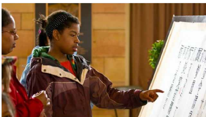
Reading poetry scrolls